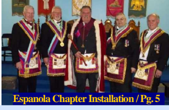
Espanola Chapter Installation / Pg. 5