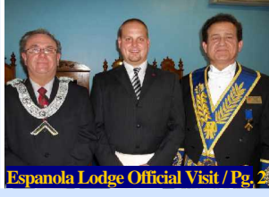
Espanola Lodge Official Visit / Pg. 2