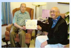
Sixty Years in Freemasonry / Pg. 4