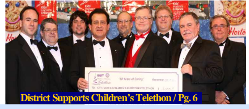
District Supports Children's Telethon / Pg. 6